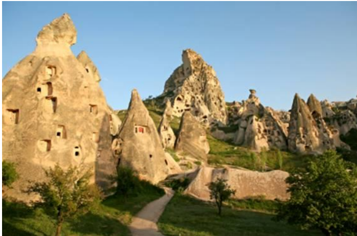
Springtime in Cappadocia

persist in central Turkey, and we'll learn about one of the region's earliest social entrepreneurs who worked to increase literacy and bring the printed word (via donkeys laden with books!) to remote villages.