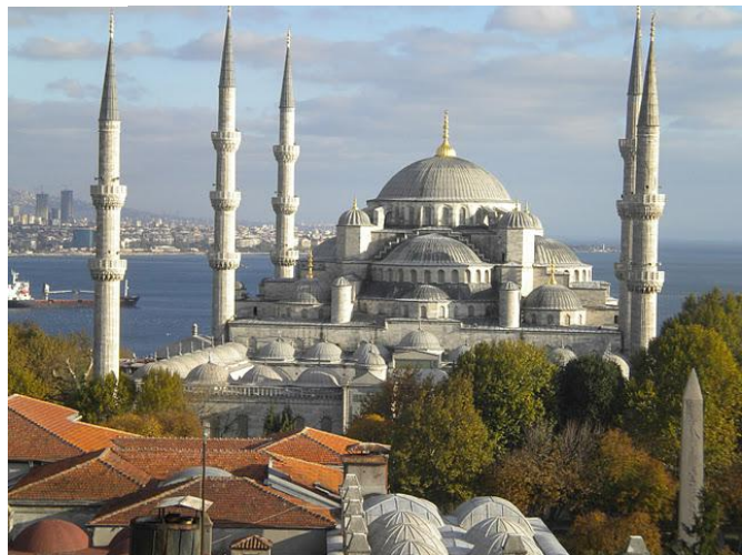
Sultanahmet, Istanbul's Blue Mosque