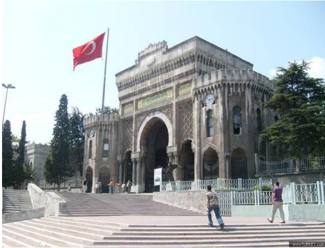
The Beyazit Gate of Istanbul University

Inside public and private libraries, the Dewey Decimal system on hand-written file-cards coexists with digitized catalogues and early inventories in Persian, Arabic, and Greek.