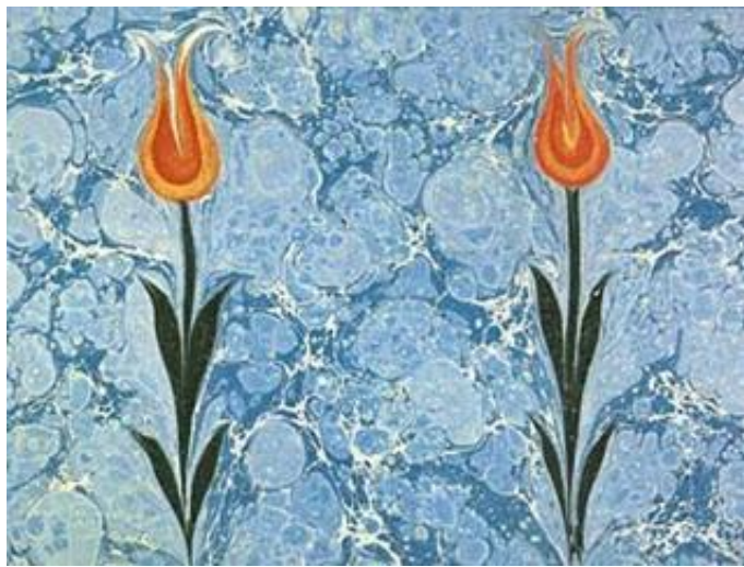
A modern example of ebru , the Turkish art of paper marbling

For the complete, day-by-day itinerary of this tour or other programs, please email either— Equinox Travel info@Equinox.com.tr or Holly Chase Holly@HollyChase.com