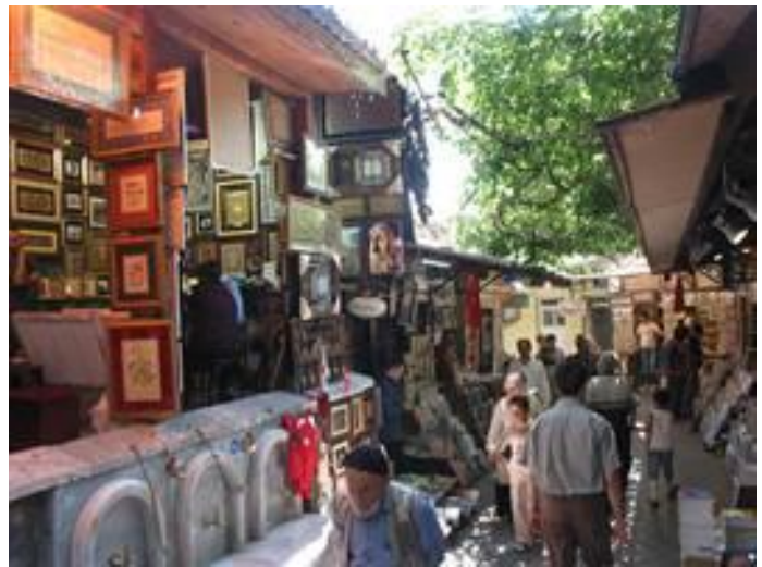
Istanbul's Old Book Bazaar

We begin in Istanbul, the only city to straddle both Europe and Asia. We'll have private access to collections that range from 15th century documents of the early Ottoman Sultanate to the extraordinary photographic archives of the German Archeological Institute. With our archeological guide, we'll travel to the Aegean region and visit the acropolis of Pergamon (whose library treasures were Marc Anthony's wedding gift to Cleopatra). Pondering the glory that was Rome, we can contemplate the magnificent Library of Celsus in Ephesus, the grandest city of the eastern Roman Empire.