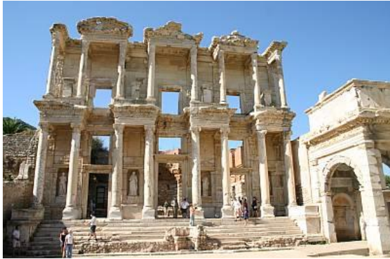
Library of Celsus at Ephesus

persist in central Turkey, and we'll learn about one of the region's earliest social entrepreneurs who worked to increase literacy and bring the printed word (via donkeys laden with books!) to remote villages.