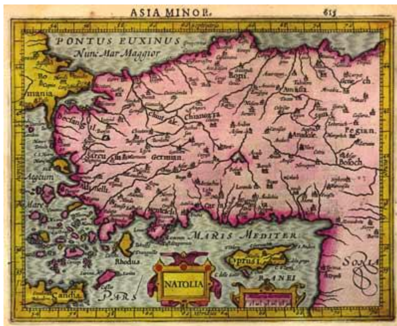
Antiquarian Map of Asia Minor, also known as Anatolia

The subcontinent of Asia Minor, now the modern nation of Turkey, boasts more than nine millennia of human settlement. This travel program has been designed to introduce library professionals and academics to Turkey's museums and libraries, overflowing with evidence of man's desire to communicate through imagery and the written word. Their holdings range from Neolithic votive figures to cuneiform tablets and parchment scrolls to exquisite gilt Byzantine illuminations, intricate Ottoman miniatures, and calligraphy.